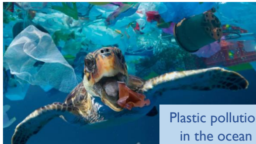
Plastic pollution in the ocean