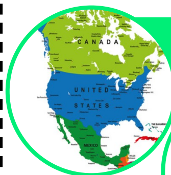
Countries of North America