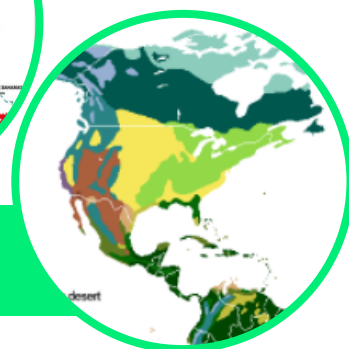
Biomes in North America